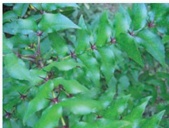
Hercules' club ( Zanthoxylum clava-herculis )

This icon of the south Atlantic coast reaches its northern limit in NC. The straight, unbranched trunk attains heights of 40 feet or more in protected areas and bears a crown of enormous (4–7 feet long!), fan-like leaves at its apex. Very resistant to salt and wind damage. Look for selections proven to be hardy in NC.