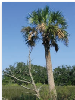
Sabal palm, cabbage palm ( Sabal palmetto )