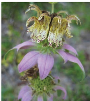
Horsemint/ Spotted beebalm ( Monarda punctata )