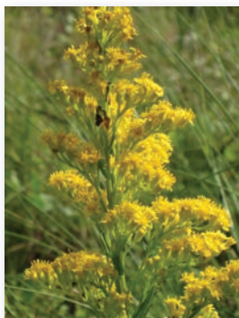
Seaside goldenrod ( Solidago sempervirens )

This stunning herb produces whorls of creamy, purple-polka-dotted flowers subtended by several pink to violet leaf-like bracts. The flowers attract many insects, particularly butterflies. Entire plant is pleasantly aromatic.