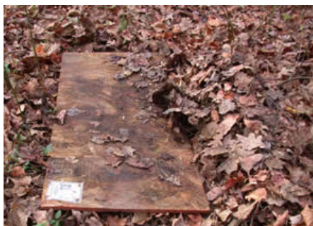
Cover boards provide refuge for snakes and lizards.

In addition to drift fences and bucket traps, cover boards (sheets of old plywood) provide great refuge for snakes and lizards. Through the course of this research project, I hope to identify any species of special interest as well as those that are threatened or endangered, or even venomous species, such as copperheads or cottonmouths, which to date have not been documented