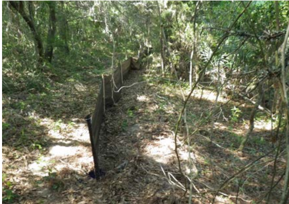
Drift fence and bucket trap being used by a BHI Conservancy intern this summer.

My name is Tyler Knierim. and I'm one of the lucky eighteen interns who is spending their summer working on the island with the BHI Conservancy. I will be conducting research on the island's reptilian and amphibian inhabitants. Drift fences, which are made from plastic cloth, silt-erosion fencing, will be constructed and installed along waterways and in dense vegetation on a few of the properties here on the island. As these animals move across the ground they will run into the drift fence and attempt to reach the other side. As they move either direction down the fence, they will fall into a 5-gallon bucket that has been dug into the ground, flush with the surface of the soil.