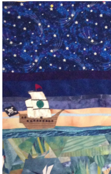
Raffle tickets for this amazing story quilt will go sale August 2.

August 1st, 2nd and 3rd as in previous years will be packed with numerous fun-filled events. From the invasion of the Pirates, the Pirate Block Party, the Pirate Booty Silent Auction, Pirates and Pancakes breakfast to the brand new Shoals Club Shindig, the Pirate Road Race, (5k&10K) and the Bricks for Kidz Pirate Lego classes. Tickets for these events and more are available now online or by phone. Volunteers are needed for all the activities to make the weekend spectacular. Help with serving, ticket taking, event set-ups, pirate boutique sales, pirate hair weaves and glitter tattoo applicators and duck race wranglers, etc. Individuals interested in volunteering or purchasing event tickets should call 910-457-7481 or visit the website: www.oldbaldy.org for more detailed information.